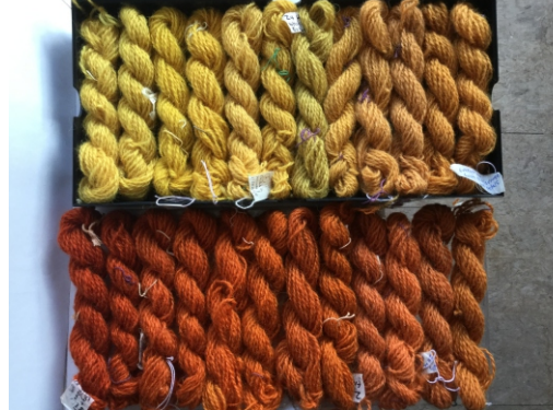
Above: Dye samples using Dahlias and Below: resulting work